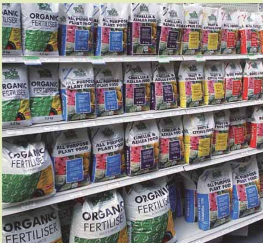
A quality range of plant food products available

Terms & Conditions: Please see Heiniger Home & Garden Price List for Terms & Conditions